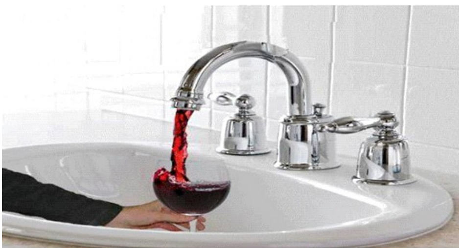
FINALLY GOT MY NEW SINK INSTALLED